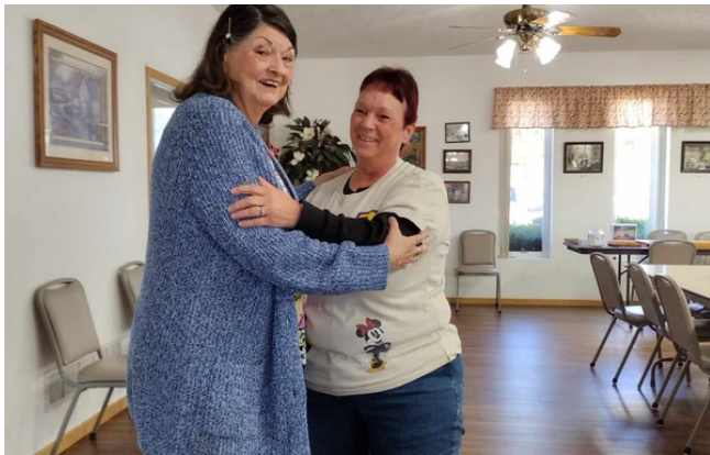
Dixon Senior Center