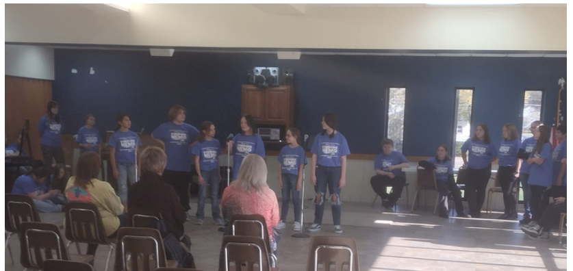
Hughes Senior Center