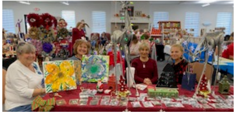
Osage Beach Senior Center