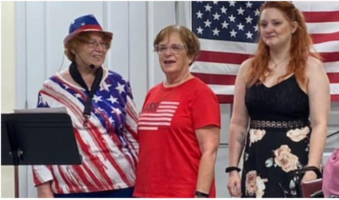
Mexico Senior Center