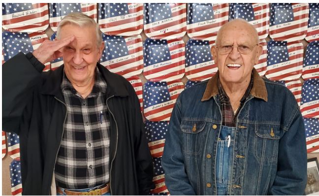
Eldon Senior Center