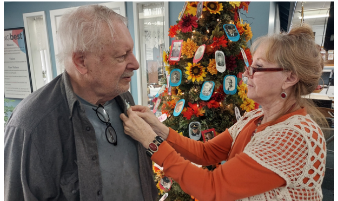
California Nutrition Center