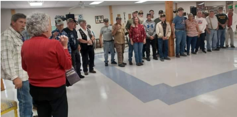
Sayers Senior Center