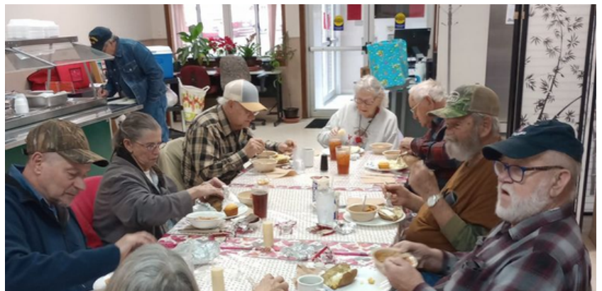
Salem Senior Center